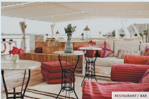
RESTAURANT / BAR